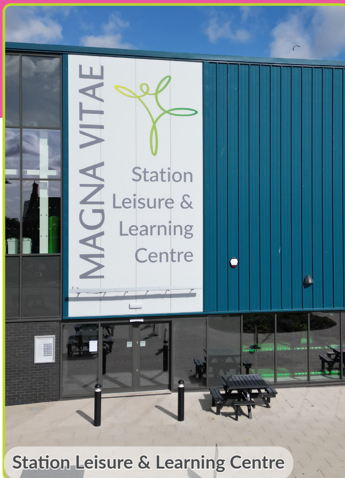
Station Leisure & Learning Centre