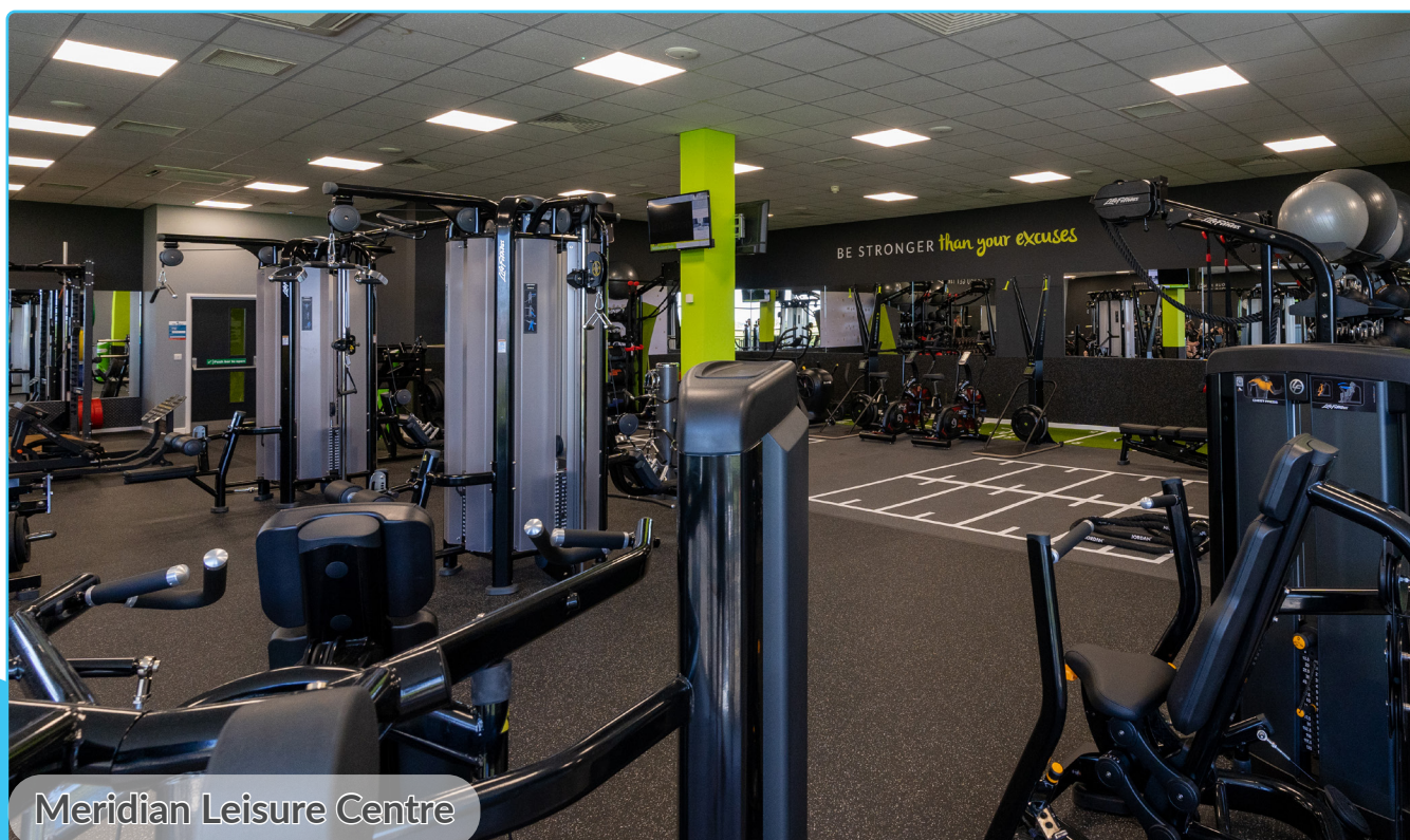
Meridian Leisure Centre

The venue is often used to host Blood Donations, National and Regional swimming galas, big sporting events and school activities and events!