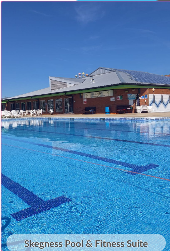
Skegness Pool & Fitness Suite