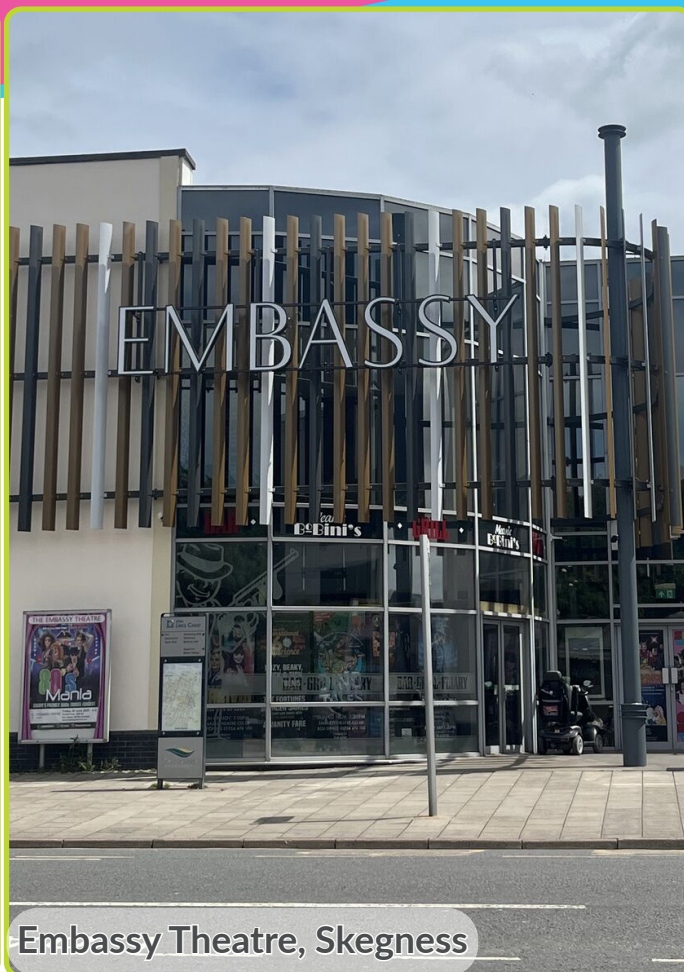
Embassy Theatre, Skegness

In addition, health and fitness memberships at Station Leisure & Learning Centre have surpassed expectation, seeing an outstanding 1,564 fitness members - And 145 swimmers currently enrolled on our WaterWise 'learn to swim' programme, with plans to help the programme continue to grow in Mablethorpe!