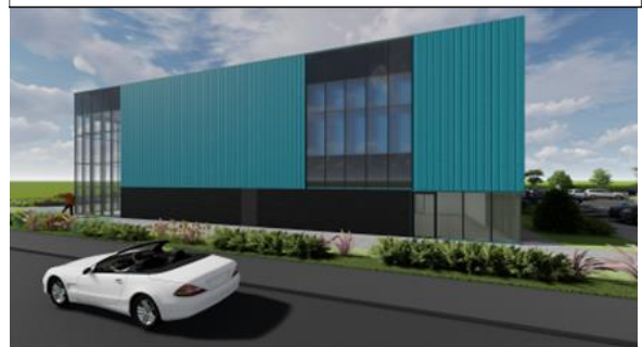
View from the new car park