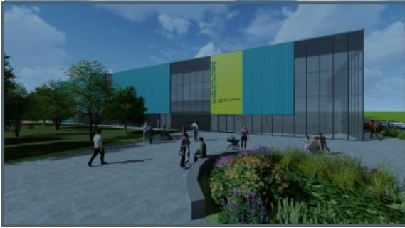
View from High Street

For your information these are some impressions of the intended building once the project is completed: