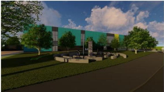
View from behind the War Memorial