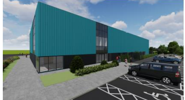
View from the new car park