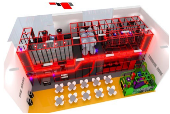
Some examples of the planned interior facilities also above