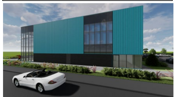
View from Station Road